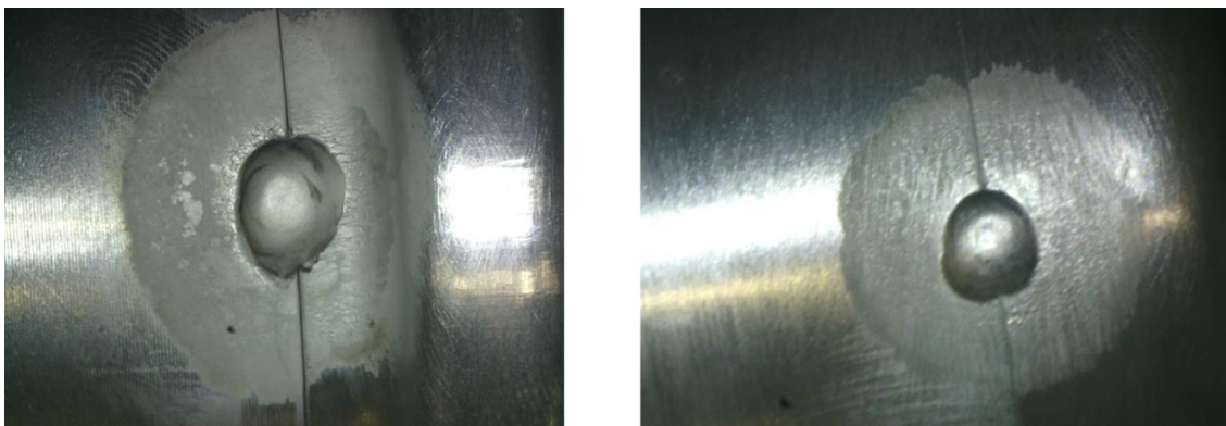
Figure 3. Shows two images of tack welds made on Aluminum with an AC balance of 60% (left) and 95% (right). The photo on the right with 95% AC balance has a minimal (5%) DCEP component and produces a much weaker frost effect which can be easily wire brushed to expose an almost pristine surface. In comparison, a 60% AC balance produces substantial frost which, on wire brushing, reveals significant surface melting.